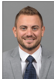
Bobby Babich Secondary/Def. Pass Gm